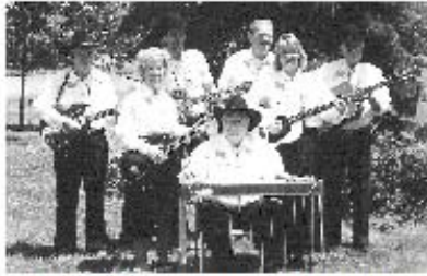
The Keystoneers (Country)