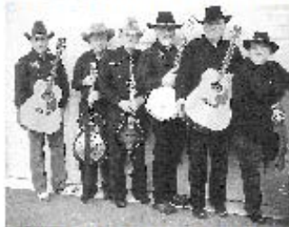
Mountain Road (Bluegrass)