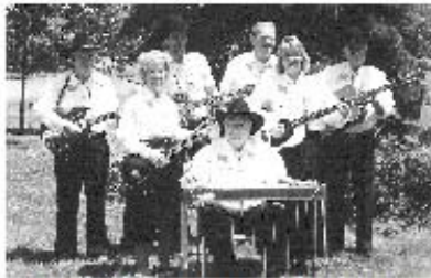
The Keystoneers (Country)