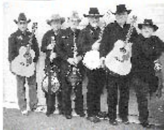
Mountain Road (Bluegrass)