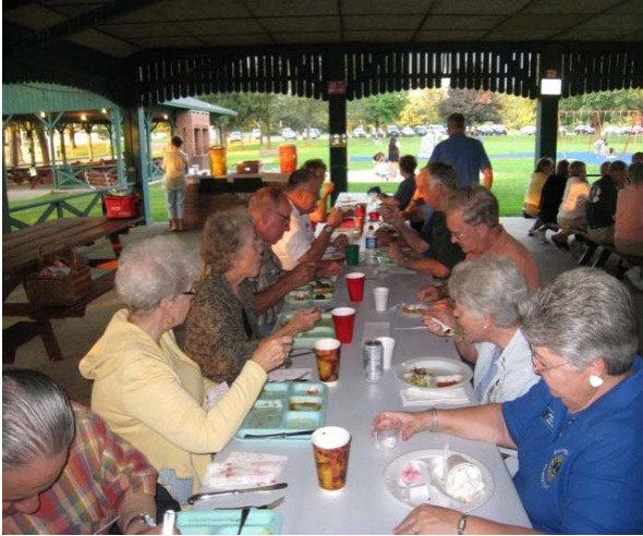
Shippensburg Lions enjoying their meals at the Annual Family Picnic at Shippensburg Memorial Park.